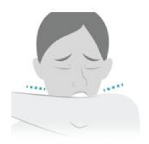
If you don't have a tissue use your sleeve