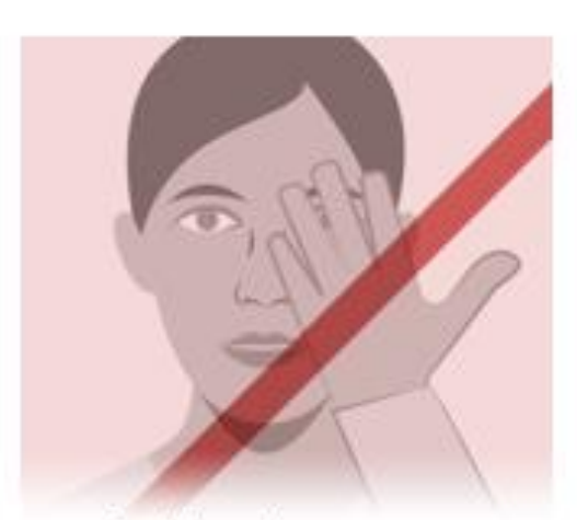
Avoid touching your eyes, nose and mouth with unwashed hands