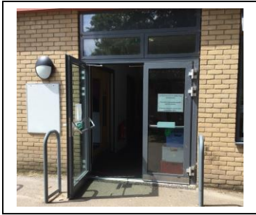
Year 4 entrance