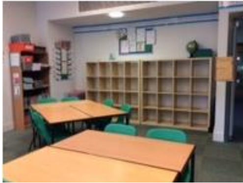
The cubby holes where you will put your bags and coats.