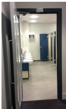
The boys and girls toilets.