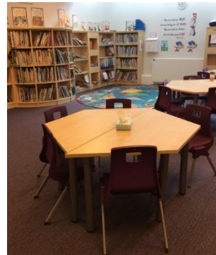
Our lovely library.