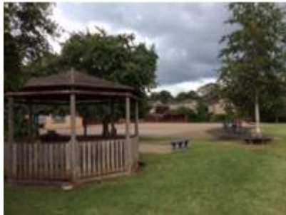
Our fantastic playground!

The cubby holes where you will put your bags and coats.