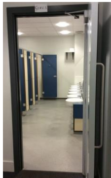
The boys and girls toilets.