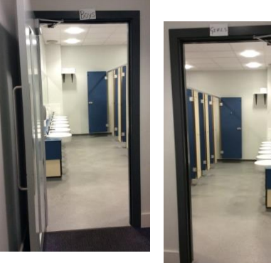
The boys and girls toilets.