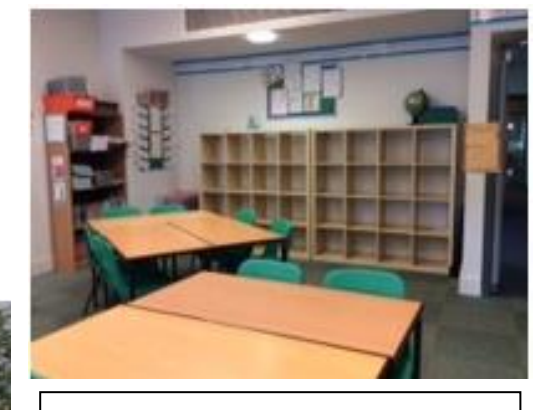
The cubby holes where you will put your bags and coats.