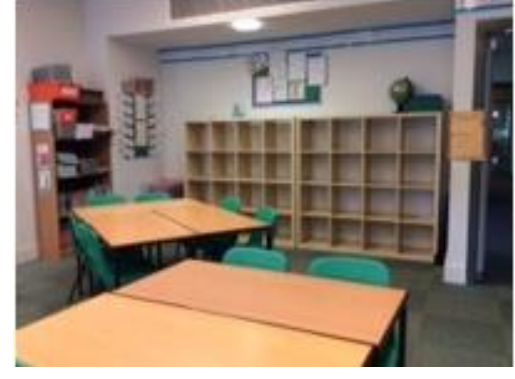
The cubby holes where you will put your bags and coats.