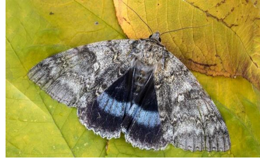
The Clifden Nonpareil moth from England. Wingspan 12cm.