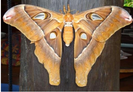
Hercules moth from Australia. Wingspan 27cm.

17 th - 25 th July, 2021: National Moth Week