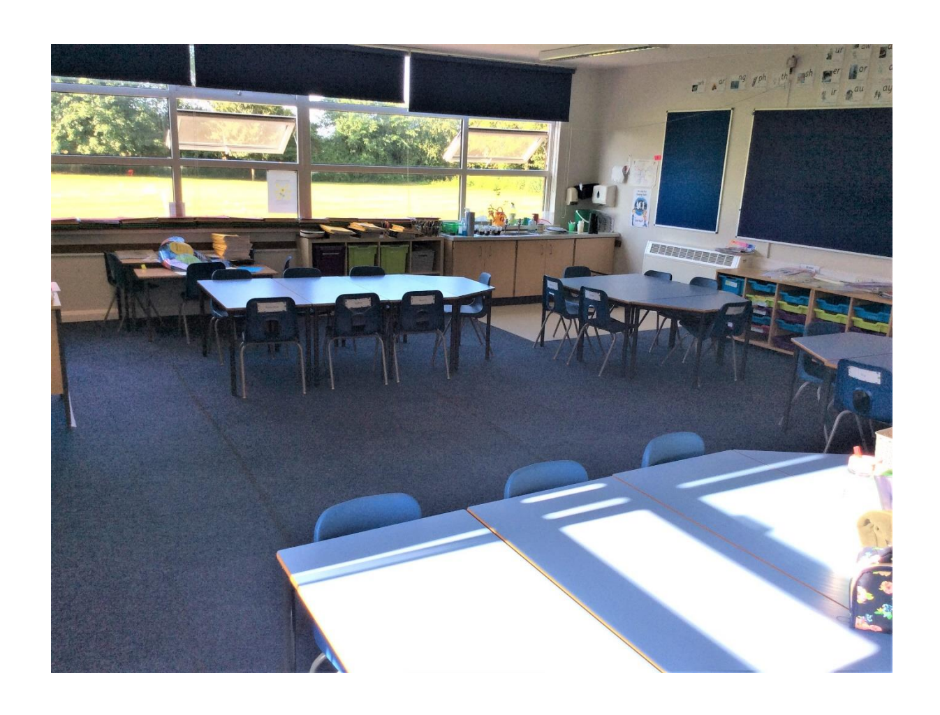
This is the 2 Willow classroom.